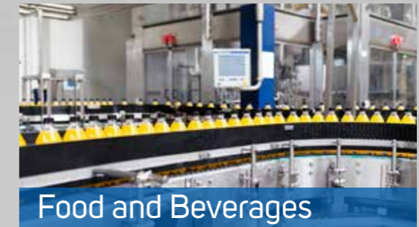
Food and Beverages