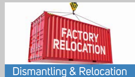
Dismantling & Relocation