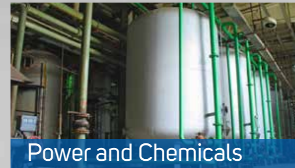
Power and Chemicals