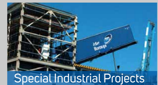
Special Industrial Projects